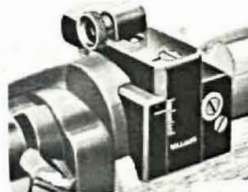
FP 17 ON THE ENFIELD

Dovetail in 1/4" width for streamlined ramp.