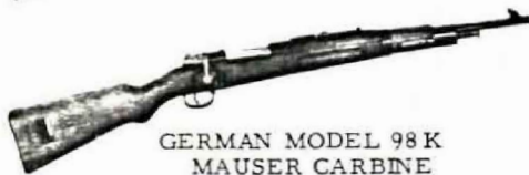
GERMAN MODEL 98 K MAUSER CARBINE