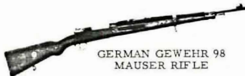
GERMAN GEWEHR 98 MAUSER RIFLE

Sight blades are designed to give shooter the utmost speed. They are interchangeable. Simply loosen six lock screw and change to any style or blade height desired. Three styles and four heights -- 1/2", 3/4", 1", and 1 1/4". Extra blades, each $1.55